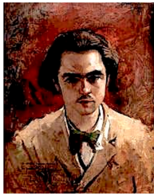
Paul Verlaine 'Decadent' French poet