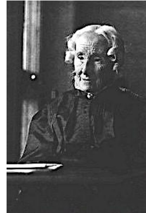
Anna Bartlett Warner